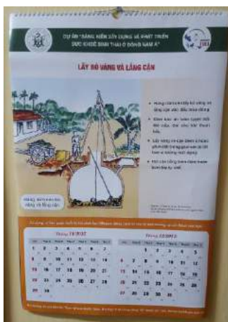
Figure 7. Health promotion messaging in a calendar

Change was also promoted at the communal level. The “Hương Ước”, a traditional document in each rural village, sets village rules in accordance to local cultures and practices. Eight rules of sanitation were added to the document, and new rules were actively promoted through loudspeakers and word-of-mouth in the community, raising awareness of farmers regarding effective biogas management.