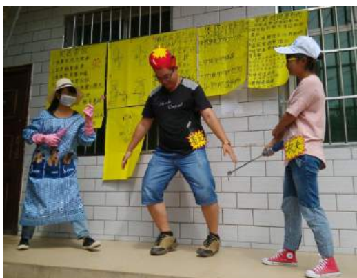
Figure 3. Street theatre performance