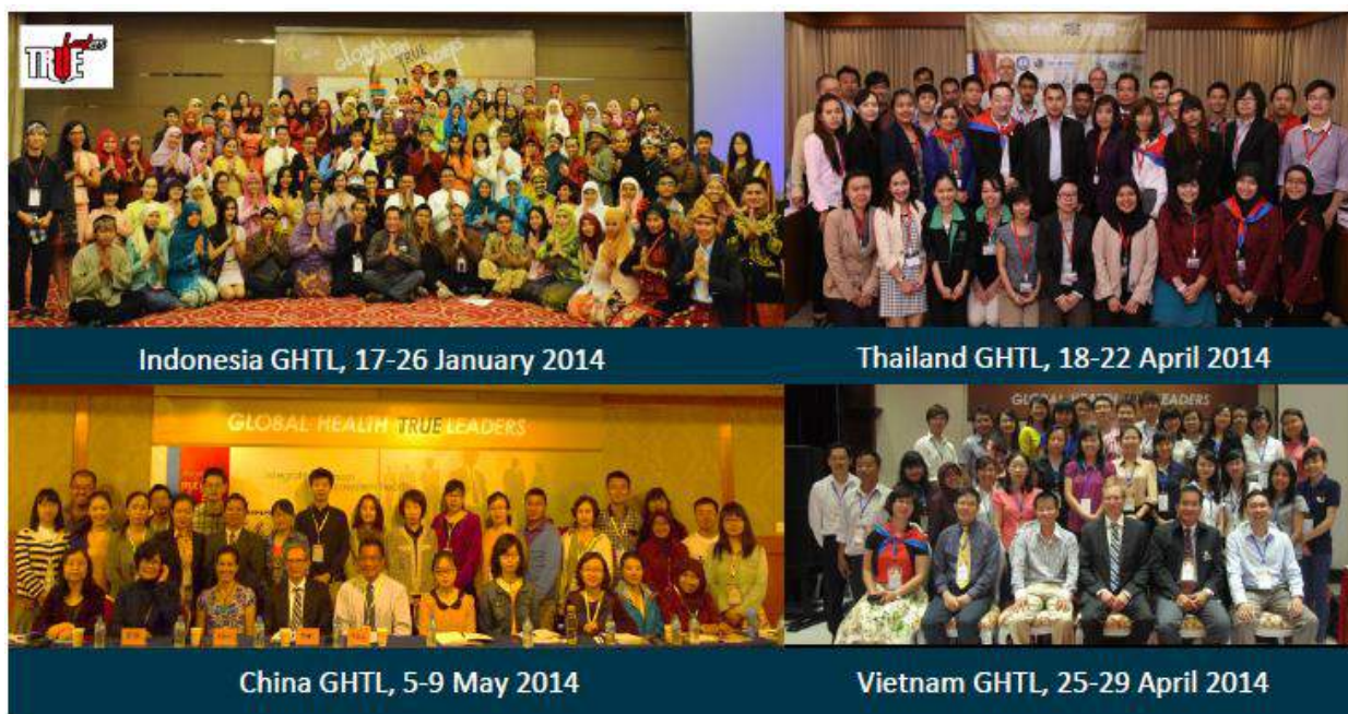
Figure 8. Cohort of Global Health True Leaders participants (Global Health True Leaders Series, 2014)

The seed funding grants were used to give funding for 24 small Ecohealth projects proposed by alumni of GHTL 2014. Awardees organized workshops, research, and community empowerment in priority areas to address local health challenge in their community.