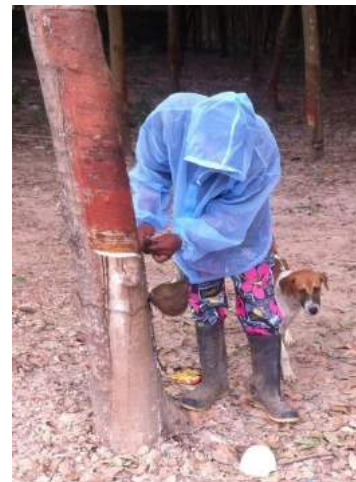
Figure 6a. Engagement of migrant workers by research team; 6b. Reducing risk of vector-borne diseases in a rubber worker using a repellent-impregnated jacket.