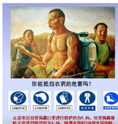
Figure 4. Health promotion poster