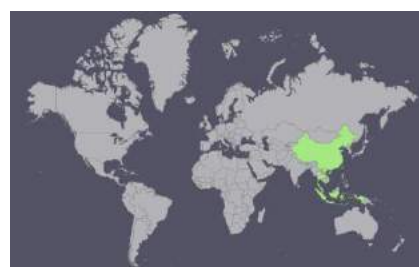
FBLI country sites