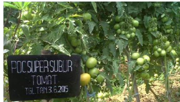
Figure 5a. Cow waste was converted and used as organic fertilizer; Figure 5b. Organic fertilizer resulted in higher production of tomato.

The conversion of farm waste into useable products had solved some environmental problems and gave additional income for the local farmers who produced waste products. The products made from farm waste include biofertilizer, casting, solid and liquid organic fertilizer, earthworms and animal herbal feed supplement. Even though several laboratory tests are still ongoing regarding efficiency and safety, local farmers in Pangalengan have produced products and sold them beyond Pangalengan area. The testimony gathered from the consumers (found at www.superjamu.com ) demonstrated significant impacts of products for crops and livestock.