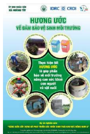
Figure 8. Health promotion messaging in traditional village regulation document